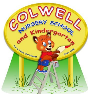
PHOTO CONSENT FORM